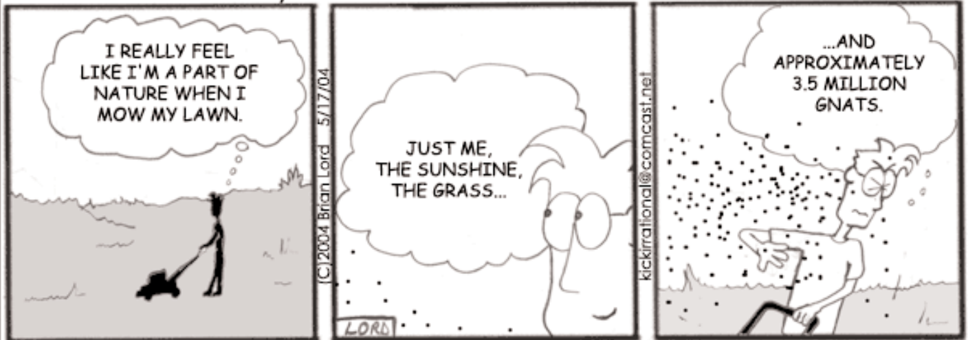
KICK IRRATIONAL by Brian Lord