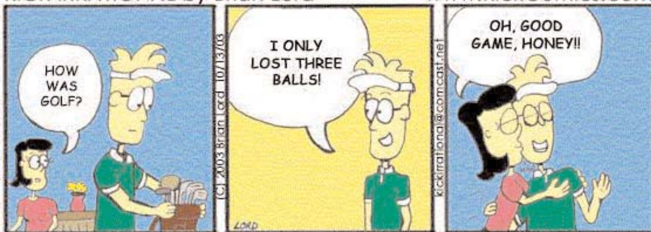
KICK IRRATIONAL by Brian Lord