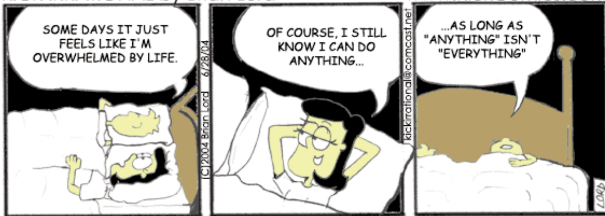
KICK IRRATIONAL by Brian Lord